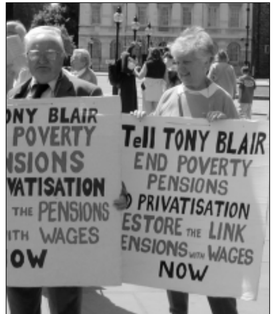
Pensioners are unimpressed by plans to privatise welfare

Early morning Tube riding public were informed of 'a new initiative' by London Underground management when dozens of Tube trains leaving from overnight depots across London were redecorated with LU style 'Business Class' and 'Cattle Class' posters segregating the carriages. To explain the new service thousands of 'official' leaflets were distributed to passengers. The leaflets announced a 'new quality service for valued customers' under the proposed Public Private Partnership deal - Business Class carriages with carpets, refreshment attendants and club-style seats plus, for full convenience, separation from the Cattle Class carriages. Which, to subsidise the new service,