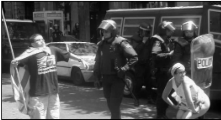
Superhero protestor confronts riot police in Barcelona last weekend

In Papua New Guinea protestors against the World Bank and its privatisation programme are shot dead by police, but in Barcelona the four-day festival of resistance goes ahead this weekend after the Bank cancels its development meeting